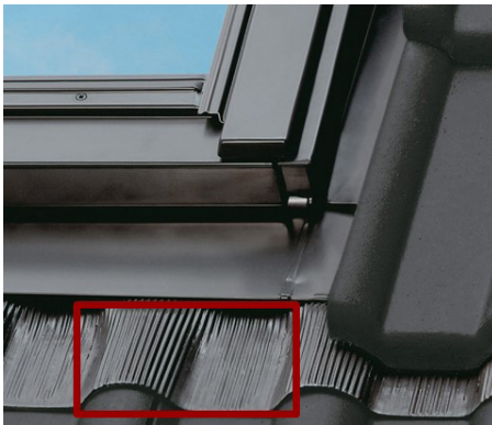
Wavy structure of the studied window part.

The company VELUX develops and produces roof windows, as well as modular skylights, blinds, shutters and ventilation systems. In order to continuously raise the product range and quality, VELUX is not only engaged in improving the production process, but also the individual materials used in the products. Exterior window components such as the installation components are exposed to significant mechanical deformation during processing and installation as well as harsh climatic conditions during service life on the roof. This leads to very high requirements on materials used as well as manufacturing processes.