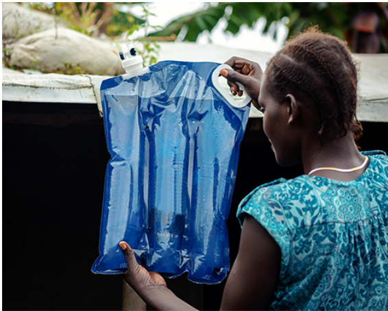
4life Solutions' special plastic bag to be used for water cleaning.

4life Solutions' mission is to change the lives of more than 2 billion people by providing access to clean drinking water. They do that by producing special plastic bags which are used to clean water when placed into sunlight. The water, contaminated with micrororganisms, is therefore poured inside the bag and placed into direct sunlight. By the interaction of UV light and heat, 99.9 % of bacteria and viruses get killed such that the water can be consumed safely. The bags can be reused up to 500 times providing ca 2000 liters of clean water. However, in order to be used that often, the quality requirements on the used plastic foils are high. Therefore, 4life Solutions contacted the 3D Imaging Centre at DTU to perform X-ray micro Computed Tomography (CT) of the plastic foils from various providers to analyse the laminar composition of the foils and verify their quality.