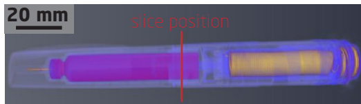
A 3D volume of the insulin pen showing the location of reconstructed slices in the following figures.

Novo Nordisk entered a collaboration with the 3D Imaging Centre at DTU through LINX, a project funded by the Innovation Foundation in Denmark. The goal of the project was to image an insulin injection pen during operation using X-ray Computed Tomography (CT) to visualise the movement of its internal parts. To follow the fast movements of small parts within the pen, it was necessary to perform the CT scans as fast as possible. In this part of the project, the measurement speed and quality were studied by tuning different acquisition parameters using an in-house X-ray CT setup, and by modifying the image reconstruction.